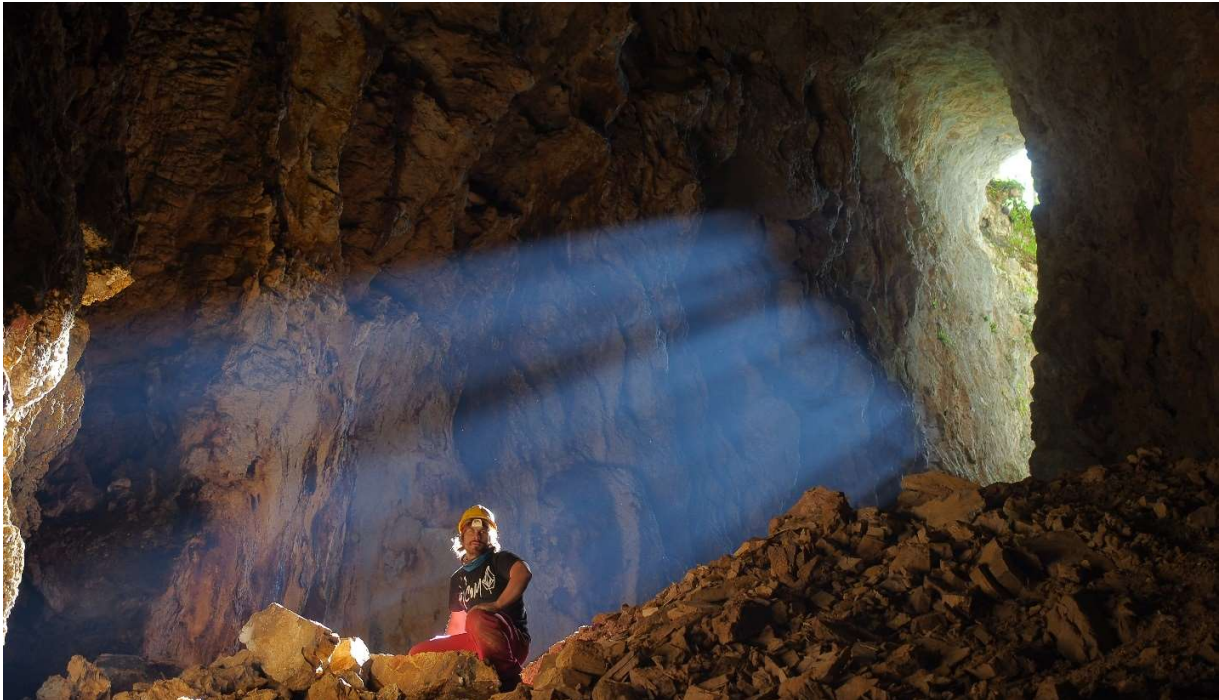
Figure 1. Inside the D-1 bauxite body from the Minjera mines

On the seventh field campaign, the PALEO and GEO teams explored and sampled the third unconformity (late Cenomannian/late Santonian – early Eocene). The primary focus of this field campaign was to sample the bauxites in the abandoned Minjera mines, together with their foot wall and hanging wall succession while also searching for additional outcrops of the third unconformity. First five days of the field campaign consisted of sampling in the Minjera mines, during which a suitable outcrop was found close to the village of Macinići. The sampling there was then conducted during the rest of the field campaign.