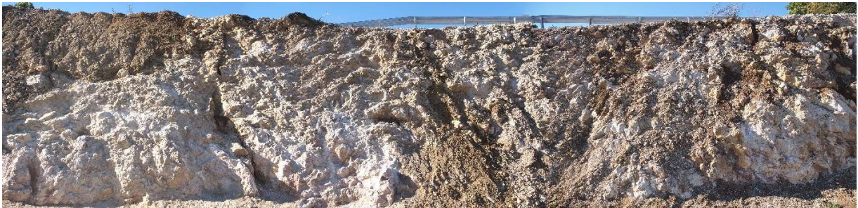
Figure 4. Panoramic picture of the main section of the outcrop

A few members from the GEO and PALEO team went to find other representative outcrops of the third unconformity, while the sampling in the Minjera mines was ongoing. Several locations were visited. The first was the bauxite pit near Labin, close to the village of Zulijani. Here, the bauxite from the bauxite pit was examined, but it was concluded that its quality is not suitable for sampling. The second one was on the outcrop of the roadcut near the village of Bertoši, but it was also deemed unsuitable for sampling. Nevertheless, one sample was collected from both locations, to compare them to other locations. Finally, the third location, also an outcrop on the roadcut, was visited and selected for detailed sampling. This one is located close to the village of Macinići. Here, the unconformity is represented with karstified cracks and depressions filled with bauxitic material, overlain with Foraminiferal limestones and Transitional beds.