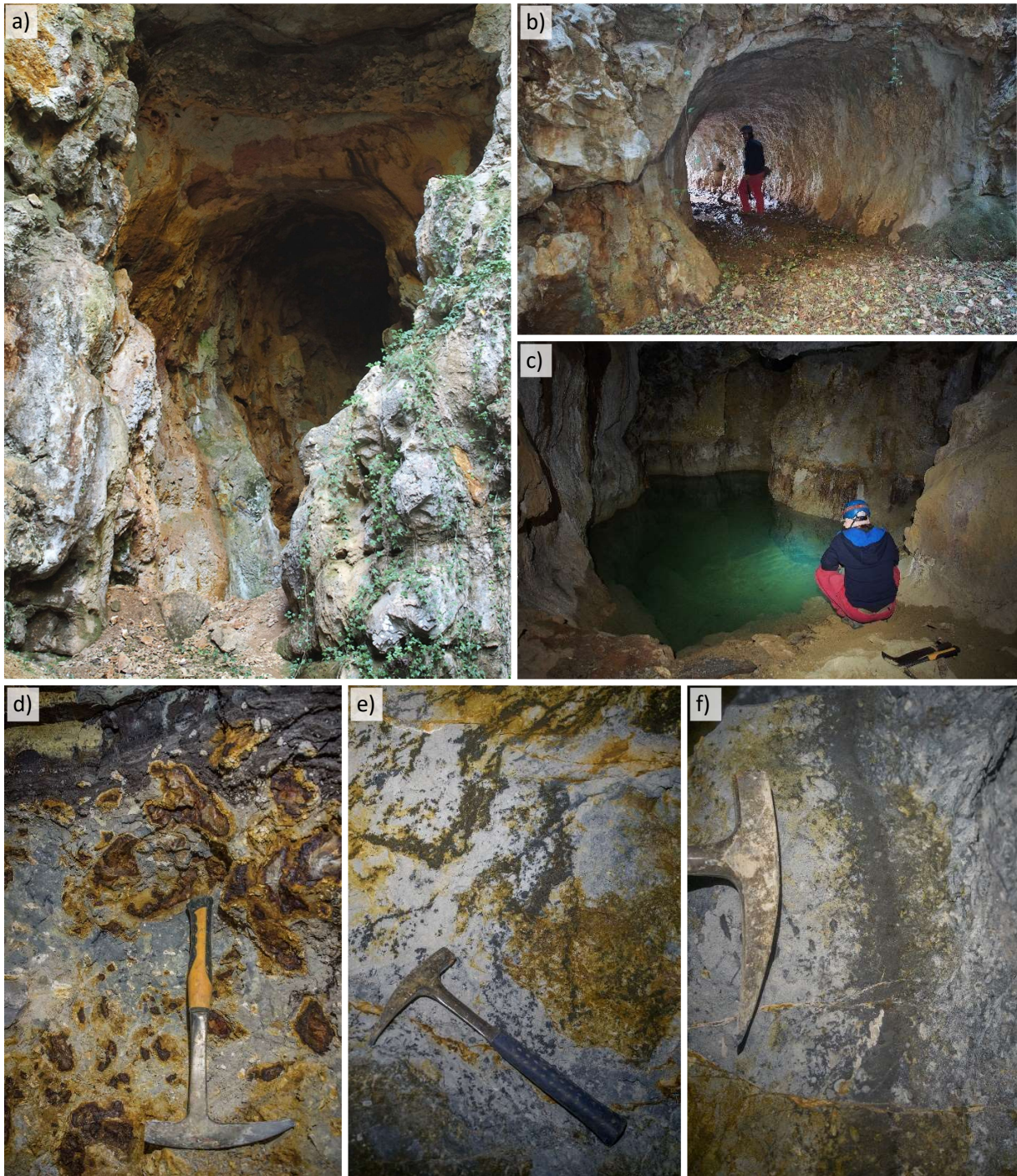
Figure 3. a) D-5 bauxite deposit, b) Entrance shaft into the D-7 bauxite pit, c) Lake in the D-3 bauxite deposit, d) Transition from the grey bauxite into the black bauxite and Kozina beds, e) Iron sulphide veins, f) Iron sulphide impregnation